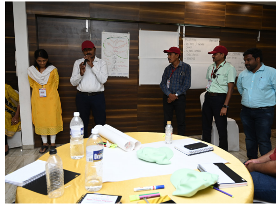
Faculty members from Maharashtra, Gujarat, Goa, Dadar and Nagar Haveli, Daman & Diu sharing their experience about field visit to rural institutions in Nagpur.