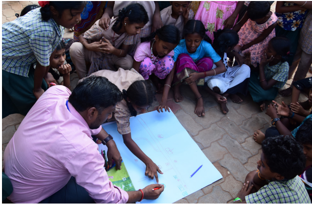
Community mapping exercise by faculty members from Tamil Nadu, Kerala, Karnataka, Andhra Pradesh, Puducherry, Telangana, Andaman & Nicobar and Lakshadweep at Valayapatti Village, Chettiyapatti Gram Panchayat @ Dindigul.