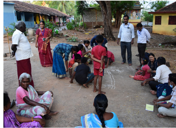
Village Mapping by Faculty Members During Field Visit at Chettiyapatti Gram Panchayat, Dindigul.