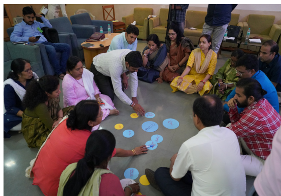
Faculty members from M.P., Rajasthan and Chattisgarh understanding local rural institutions using the Venn diagram/chapati diagram method.