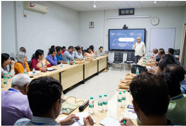
Faculty Members from UP, Delhi, Uttarakhand, J&K, Ladakh and Himachal Pradesh understanding the principles and course design of Community Based Participatory Research (CBPR).