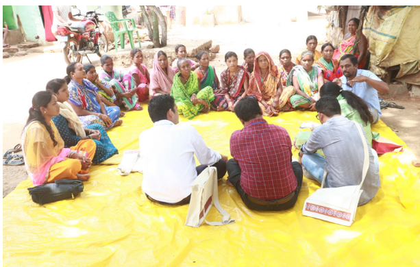
Faculty members from West Bengal, Bihar, Jharkhand, Odisha and Sikkim building rapport with community members at Barakutuni Village, Koraput, Odisha.