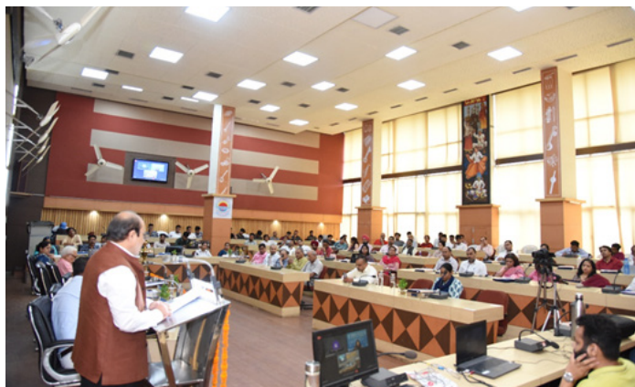
Participants from Delhi, Haryana, Chandigarh and Punjab at Master trainers training programme in CBPR, Kurukshetra.

Above photographs are from the face to face Master Trainers Training Programme on Community Based Participatory Research (CBPR) held at UGCs 7 Regional Centers from April to July, 2022.